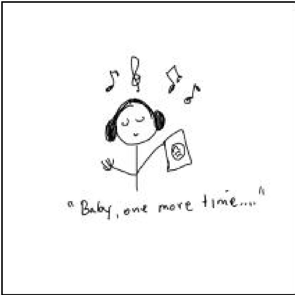
[1] User - Seo is an avid music listener who enjoys singing along to songs using real-time lyrics feature