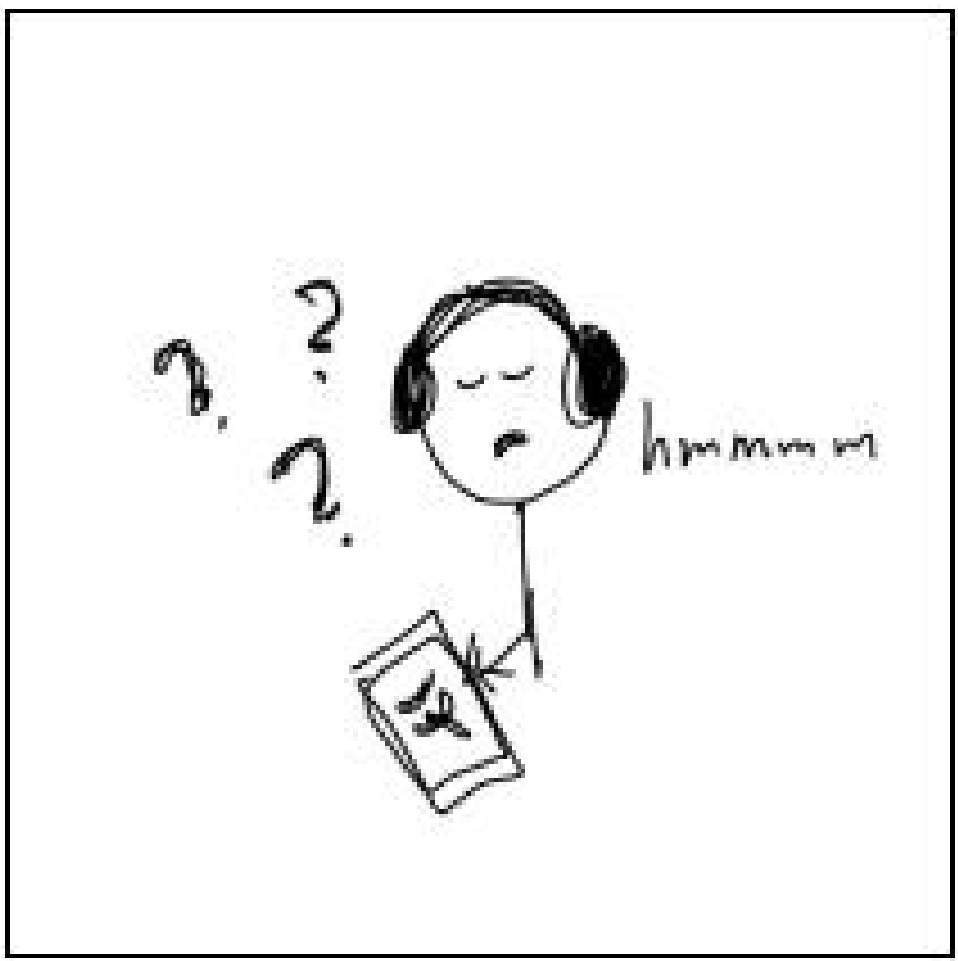
[2] Problem - Seo finds it a bit frustrating she cannot share her singing skills with friends