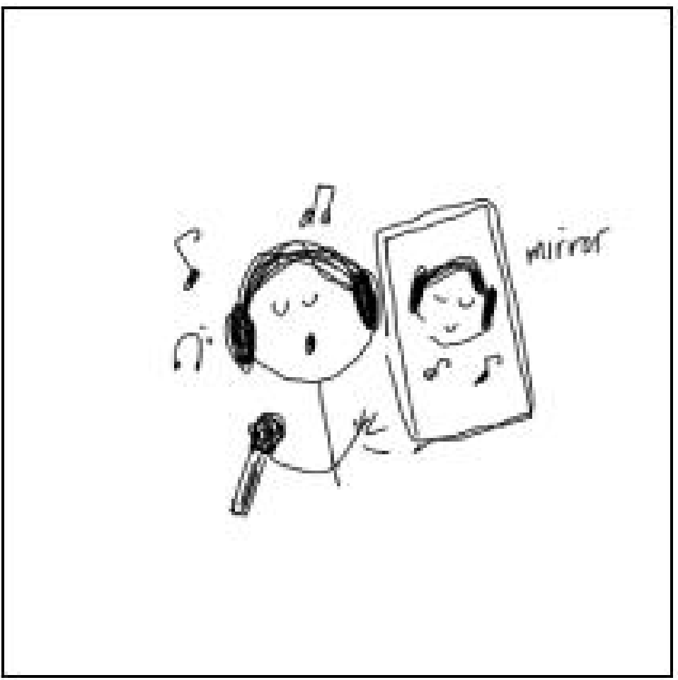
[3] Solution - Feature that allows her to record video snippets of herself singing