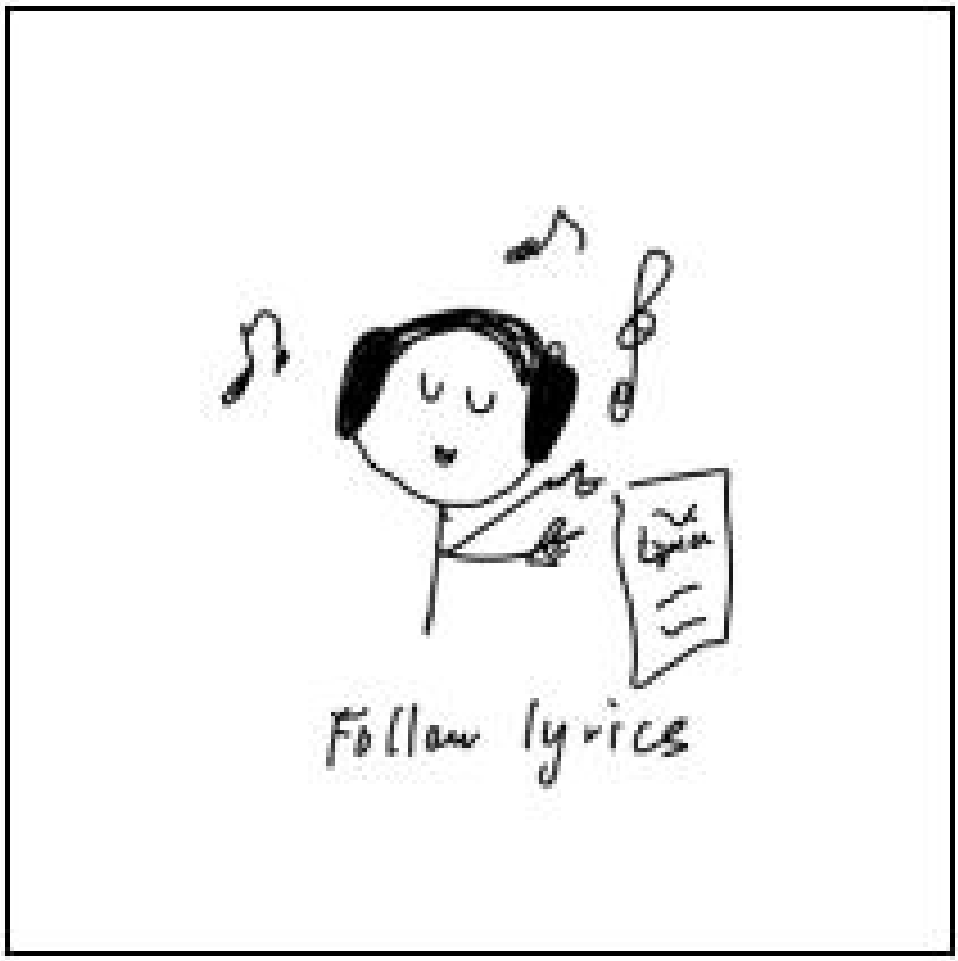
[5] UX App - Can also follow along to a more robust real-time lyrical feature